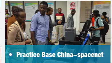
• Practice Base China-spacenet