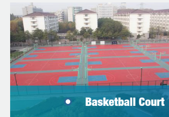
• Basketball Court