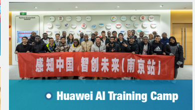
• Huawei AI Training Camp