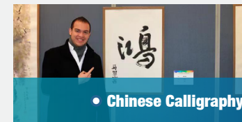
• Chinese Calligraphy