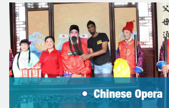
• Chinese Opera